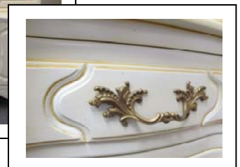
One of Grace's creations!